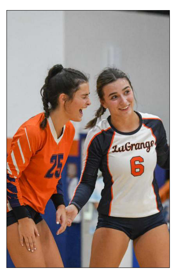
ALSKJDFASD | DAILY NEWS